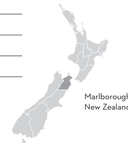
Marlborough, New Zealand