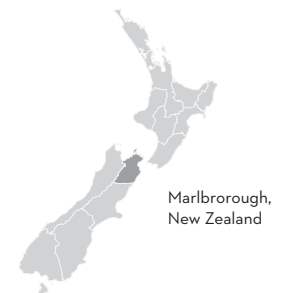
Marlborough, New Zealand