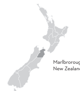
Marlborough, New Zealand